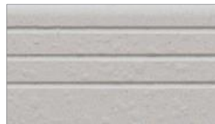
white 200 x 75mm