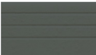
dark grey 200 x 75mm

Providing additional slip resistive features with moulded grooves, NITO stepthreads offer exceptional hard wearing performance benefits required in commercial installations.