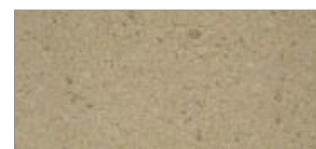
beige 300 x 600mm