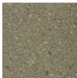
grey 300 x 600mm 600 x 600mm