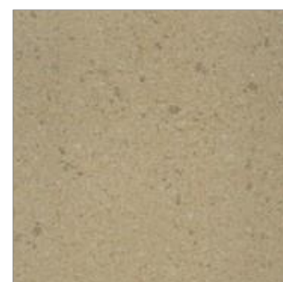
beige 300 x 600mm 600 x 600mm