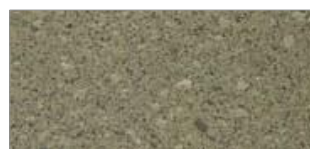
grey 300 x 600mm