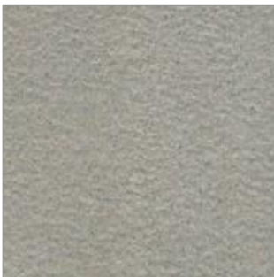
melody gris 300 x 600mm 600 x 600mm

Polished is suitable for prestigious developments where the luxury of a high gloss surface is an important part of the designer's aesthetic. Our polished tiles feature contemporary neutral shades that complement retail, residential and commercial interior themes. The Nito polished collection co-ordinates with the Nito matt and rustic collections for a seamless transition.