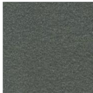
melody nero 300 x 600mm 600 x 600mm