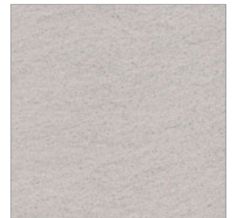
beige 600 x 600mm