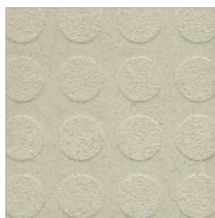
ivory 200 x 200mm